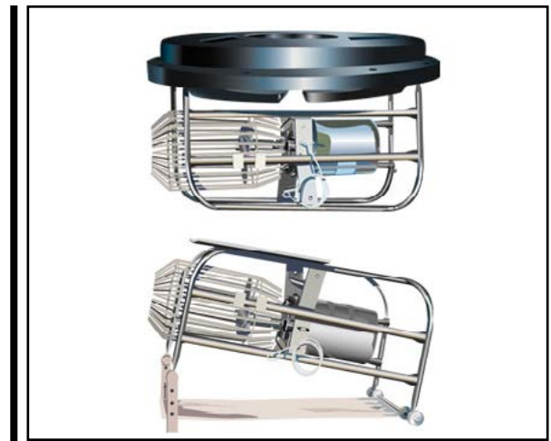
CAD DRAWING: Mixer Industrial Aerator

ACCEPTABLE MANUFACTURER: This unit shall be an OTTERBINE Mixer Industrial Aerator manufactured by OTTERBINE BAREBO, INC., 3840 MAIN ROAD EAST, EMMAUS, PA 18049 U.S.A. PH: (610) 965-6018. WEB: www.otterbine.com