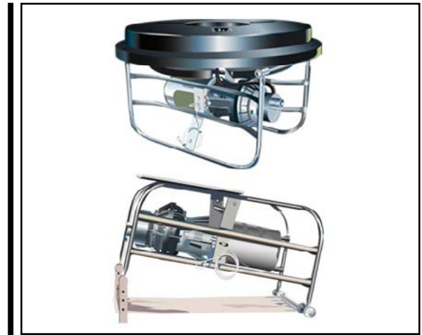
CAD DRAWING: Aspirator Industrial Aerator

ACCEPTABLE MANUFACTURER: This unit shall be an OTTERBINE Aspirator Industrial Aerator manufactured by OTTERBINE BAREBO, INC., 3840 MAIN ROAD EAST, EMMAUS, PA 18049 U.S.A. PH: (610) 965-6018. WEB: www.otterbine.com