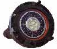
MR16 LED Low Voltage

Otterbine LED low voltage light systems come with an energy efficient 6.5W bulb that is available in a bright white (5700K) or warm white (3000K) flood lamp. System operates off 115V in 60Hz, and 220V in 50Hz; options include photocell and colored lenses. Manufactured from corrosion resistant thermal plastics, our LED light systems come standard with cable quick disconnect connection.