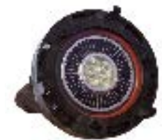
MR16 LED Low Voltage

*Used on 1/2HP units. **Requires multiple cable runs, (One cable run for every four lights.). 50Hz amp draw will be half of what is listed in charts.